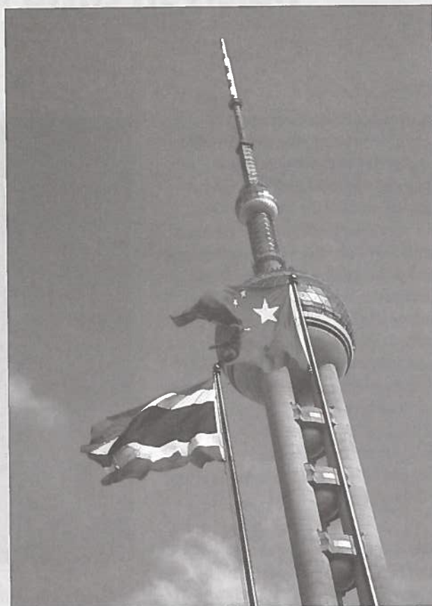
Oriental Pearl Tower in Shanghai, China

Contact Dick Vanderbosch, CPCU, at (970) 663-3357 or rbosch@aol.com